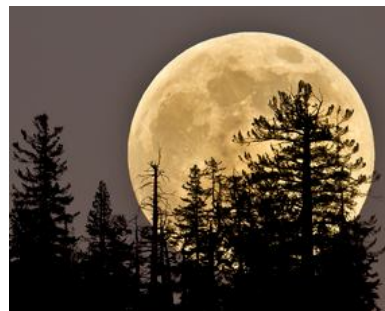
Yosemite Super Moon June 2013

The Forest needs volunteers in the Recreation department and in other general forest management activities. Contact Molly Fuller or Marie Malo at Summit Ranger District. (209) 965-3411