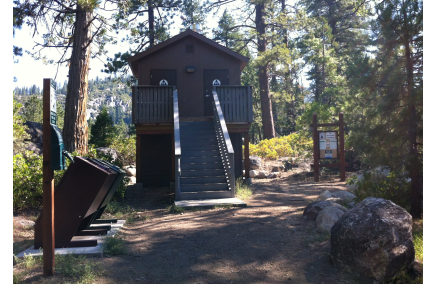
Sunrise Point Restroom & Picnic Area

This year, FOP contributed to several evening interpretive campfire programs, specifically ones that the Forest Service pays outside specialists to conduct. "Wild Things," "Snakes Alive!" and "Batty About Our Insect-Eating Friends" were sponsored by Friends of Pinecrest.