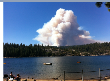
Power Fire: Day 1 Scene from Pinecrest Lake August 5, 2013

Welcome to Nick Wood, the Summit District's new Law Enforcement Officer. Please say hello when you see him.